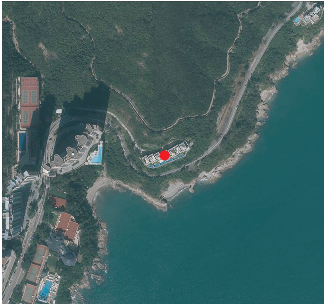
● Location of the Development 發展項目的位置

Survey and Mapping Office, Lands Department, The Government of HKSAR © Copyright reserved - reproduction by permission only.